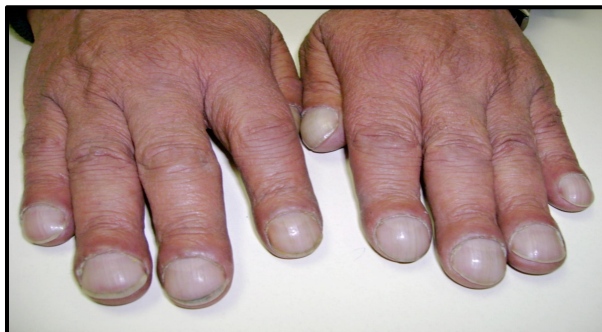
Fingernail clubbing in severe asbestos exposure.