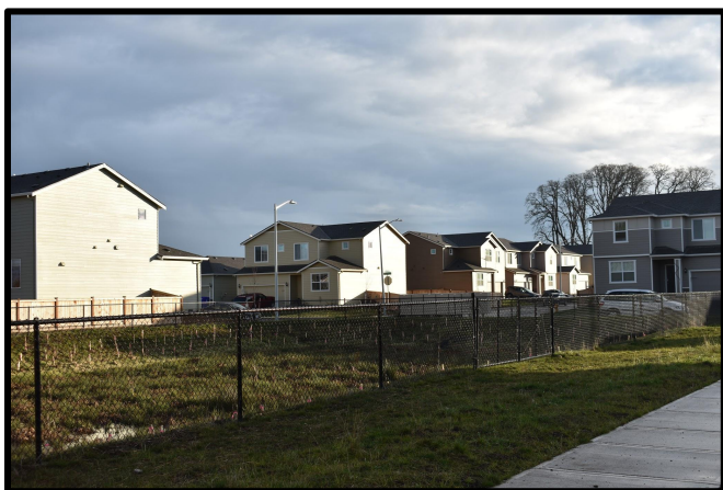
Bear Creek Housing is taking shape.